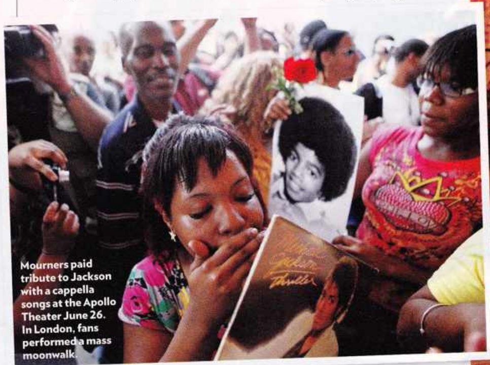
Mourners paid tribute to Jackson with a cappella songs at the Apollo Theater June 26. In London, fans performed a mass moonwalk.