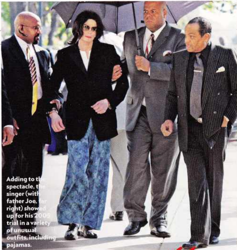
Adding to the spectacle, the singer (with father Joe, far right) showed up for his 2005 trial in a variety of unusual outfits, including pajamas.

If so, he was to be spectacularly unsuccessful. In 2003 a 13-year-old boy who was a cancer survivor befriended by Jackson made similar accusations and pressed ahead with a criminal case. The prosecution relied in part on the Bashir documentary, in which Jackson bizarrely defended his practice of sleeping with kids—innocently, he claimed—who were not his own. "It's very right; it's very loving," he told Bashir. Still, the sometimes circus-like 2005 trial, which lasted 14 weeks and featured one memorable episode in which Jackson gleefully danced on the roof of his SUV, ultimately turned into a referendum on the accuser's mother, who, as the defense pointed out, had once been implicated in a welfare fraud. After seven days of deliberation, the jury acquitted Jackson of all charges, but