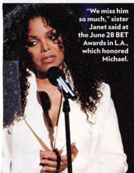
"We miss him so much," sister Janet said at the June 28 BET Awards in L.A., which honored Michael.

says the singer actually did receive a daily injection of Demerol. Asked if Michael's death was drug-related, dad Joe, 80, told PEOPLE, "That's what we're trying to find out."