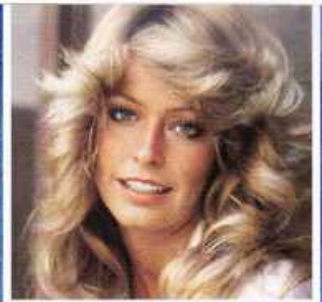
FARRAH FAWCETT BRAVE LAST DAYS