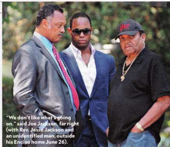
"We don't like what's going on," said Joe Jackson, far right (with Rev. Jesse Jackson and an unidentified man, outside his Encino home June 26).