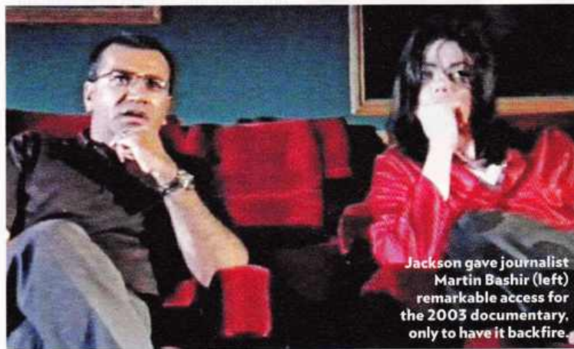
Jackson gave journalist Martin Bashir (left) remarkable access for the 2003 documentary, only to have it backfire.