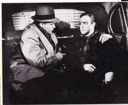
Rod Steiger (with Marlon Brando in On the Waterfront ) was shocked that Kazan turned informant.

A s a moviemaker, Elia Kazan made his reputation as the director of such Hollywood classics as A Streetcar Named Desire and On the Waterfront . But for half a century his creative legacy has been shadowed by what many still see as an unforgivable political act: In 1952, Kazan chose to cooperate with the House Un-American Activities Committee,