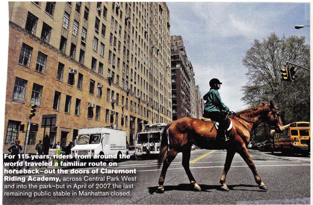
For 115 years, riders from around the world traveled a familiar route on horseback—out the doors of Claremont Riding Academy, across Central Park West and into the park—but in April of 2007 the last remaining public stable in Manhattan closed.

Fortunately for Amy and me, Claremont's closing was still seven years in the future (and the park's bridle paths still up to par) when we took our ride. Actually, we took a couple of rides that week. The first one went along without a hitch, and we