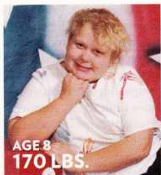
AGE 8 170 LBS.