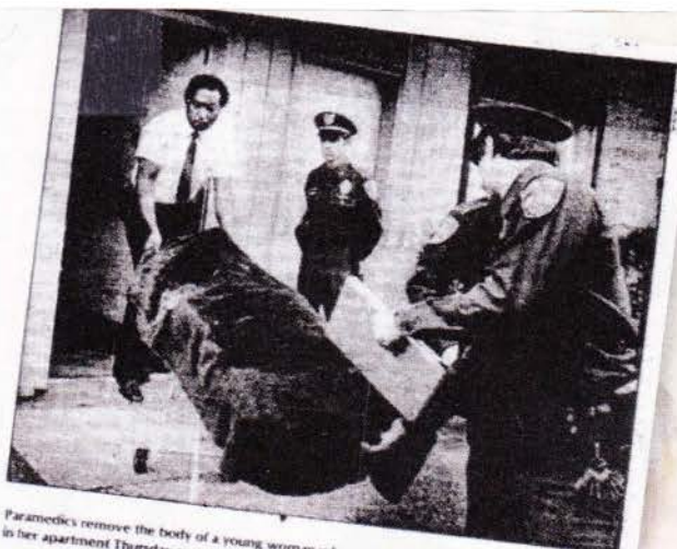
Paramedics remove the body of a young woman who was found stabbed to death in her apartment Thursday morning.